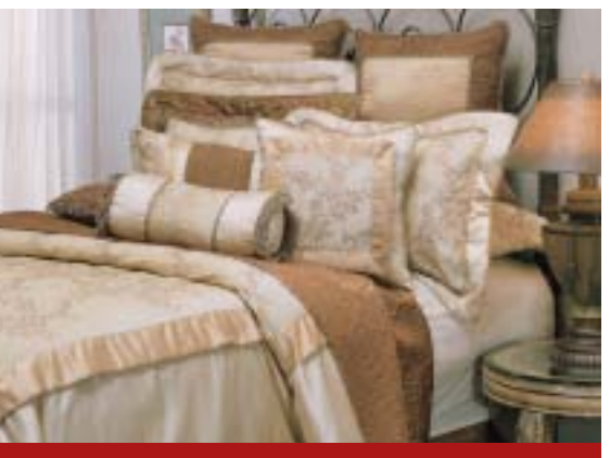
GTT International is offering this Climbing Vine pattern as one of its four Seasons Bed Ensembles, which feature reversible coverlets, decorative pillows and shams.

Sleep Studio also features new Performa memory foam pillows, molded in sleek, functional designs to provide the ideal shape for a perfect night's sleep and constructed of high-density memory foam. Performa pillows are offered in four styles, Contour, Soft, Firm and Duet, each designed for a specific sleeping position. The Contour, Soft and Firm designs are covered in Coolmax fabric, and the Duet pillow features a combination of memory foam