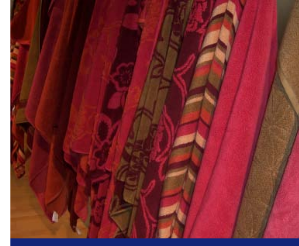
Loftex highlights exotic floral motifs and an eclectic mix of textures and rich colors in its new Turkish Delights towel collection.

Lintex Linens offers Squares, a woven retro-look rounded square motif, and Kalvin, a contemporary woven alternating thick and thin vertical lines; the Circles throw from Klippan of Sweden features retro circles in red, black, taupe, yellow, blue and lime; Twinkle Living highlights Zig-Zag and Lego geometric bedding in chocolate and ivory; Revman's Modern Squares bed is a contemporary geometric from the licensed Echo collection; the Islands area rug from Angela Adams features random circles tossed on a solid ground and the designer's Mammy rug features asymmetric cut-off ovals. �