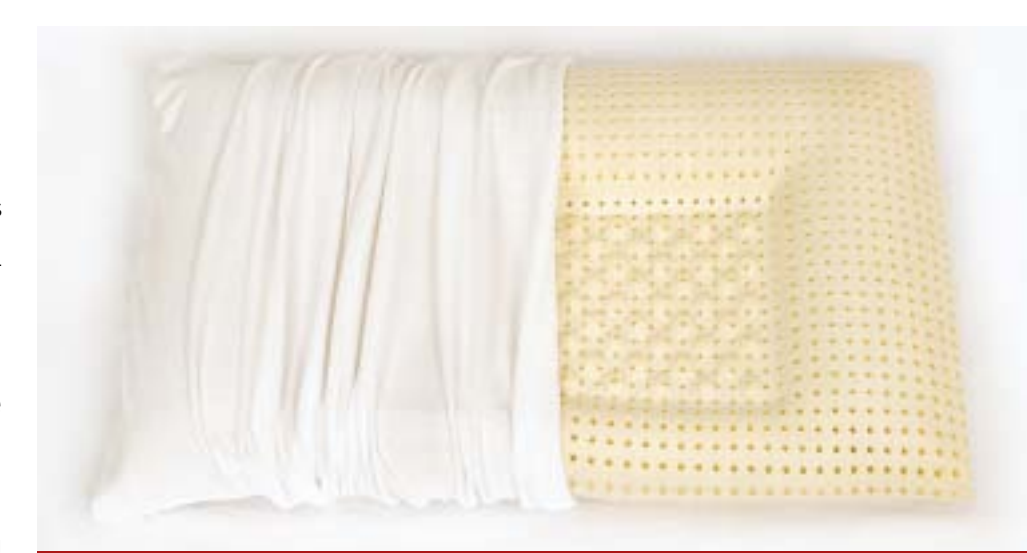
Sleep Studio is offering revolutionary new Performa memory foam pillows, molded in sleek, functional designs, including this Contour shape, covered in Coolmax fabric.

PHI is offering a new pyramid packaging system for its solid-color Egyptian cotton sheets. "Our packaging team has been busy coming up with new concepts for our core sheet programs," remarks Kirsten Sedestrom, creative director.