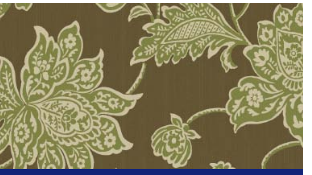
Waverly's Eveard Damask pattern in chocolate and avocado updates this classic design motif.

No home textiles assortment is complete without a selection of fresh-picked floral fashions, and this season, suppliers are highlighting traditional looks with a twist.