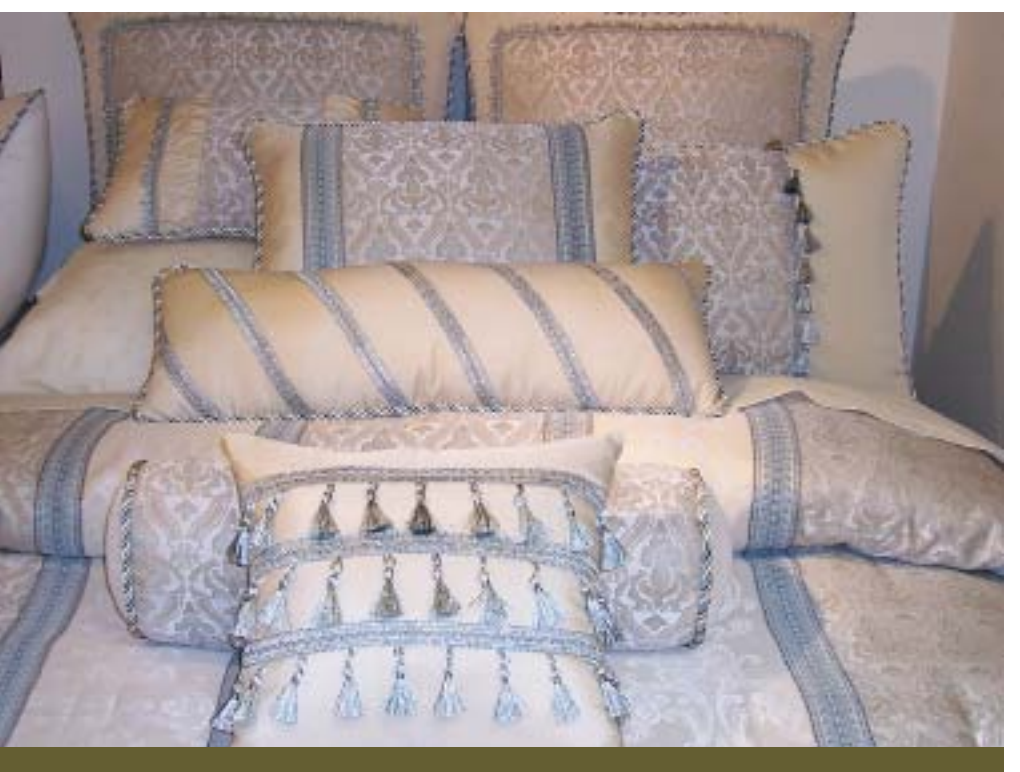
Arrow Home fashions uses lush braids and tassels in this Wellington ensemble, featuring soft shades of aqua, ivory, gold and taupe.

Many suppliers are bringing extra texture to fabrics with the addition of flocking, puff printing, puckering, seer-sucker, crinkle and crashing techniques. PHI, for instance, offers the flocked Velvet Rose design in window treatments and shower curtains.