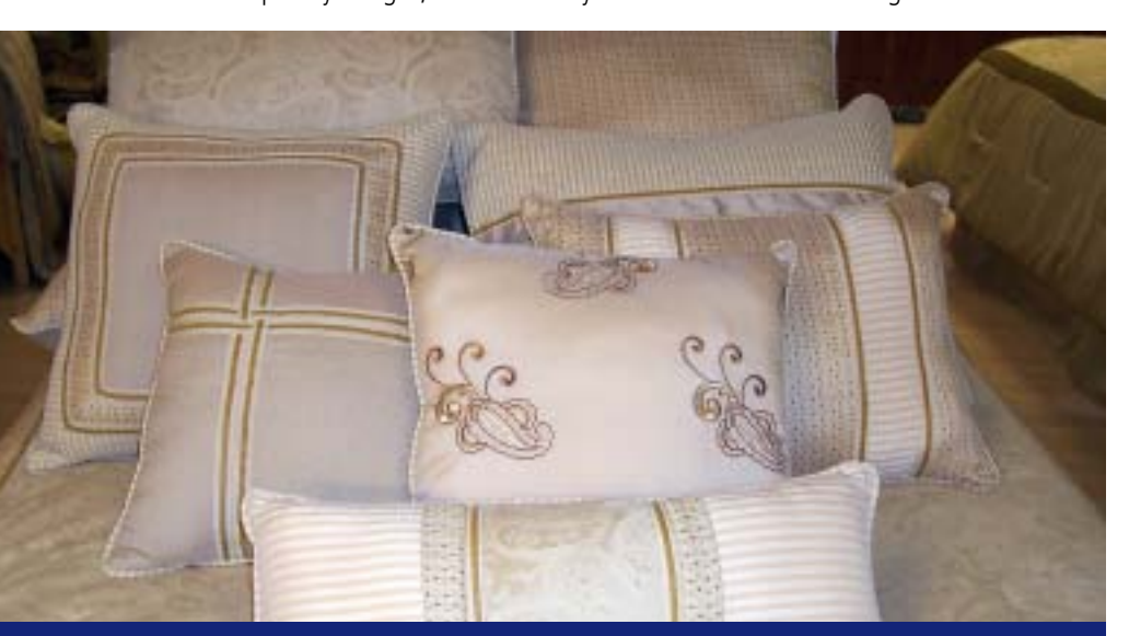
Arrow Home fashions combines technically advanced fabrications with a traditional paisley in soothing shades of gold, amber, sage and cocoa.

Plaids also are ubiquitous this season. For example, Lintex Linens offers a classic gingham check in 11 colors in its Kristal Kleen kitchen towels, constructed