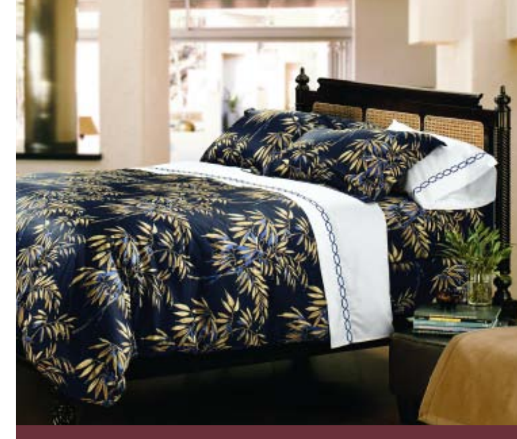
Cuddledown Willow Sateen

"Black is still an important basic coloration in the market," notes Charles Cilley, national sales manager, Cuddledown. "Color families that are coming up are neutrals, including black, ivory taupe and chocolate, mixed with grays and gray-toned colorations. These colors will be important decorating foundations as interiors transition to more soothing environments. Interest